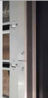
Low-profile side track