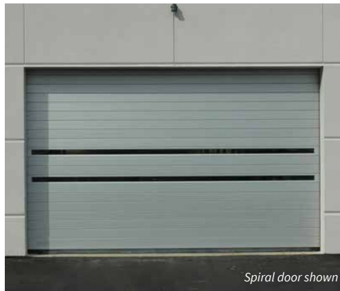
Spiral door shown