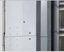
Powder coated side column cover