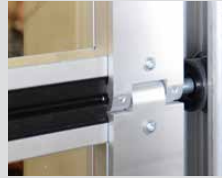
Rollers with sealed roller bearings