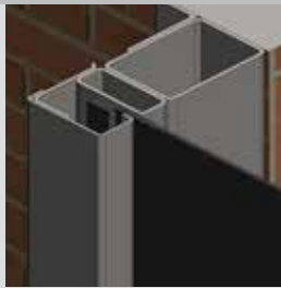
Windlocks help door provide additional wind resistance