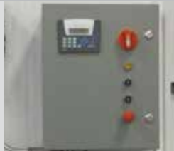
PLC Controller allows for fully customizable configurations for every application

Standard maximum sizes shown; larger sizes may be available upon request.