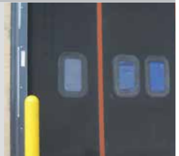
Window option shown