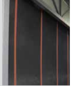
Vertical stripes for added safety