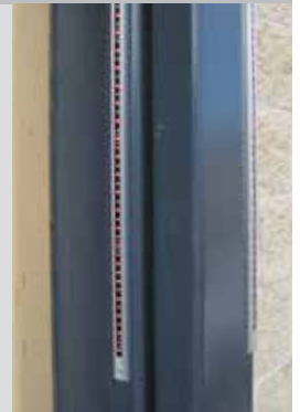
Pathwatch warning lights